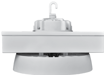
DAMP LOCATION (LEDBB/D, SD347/D, SD480/D)

Available for both Damp & Wet Locations. With a proprietary design, selecting the wet location option will allow the fixture to remain IP65 rated & NSF listed.