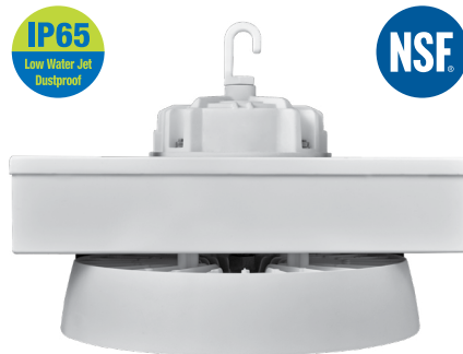
WET LOCATION (LEDBB/W, SD347/W, SD480/W)