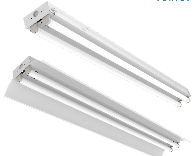
Shown with White Reflector Option